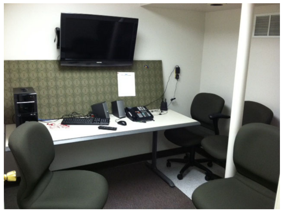
Child forensic interviewers and police officers review video with exacqVision Professional client software in the team room.